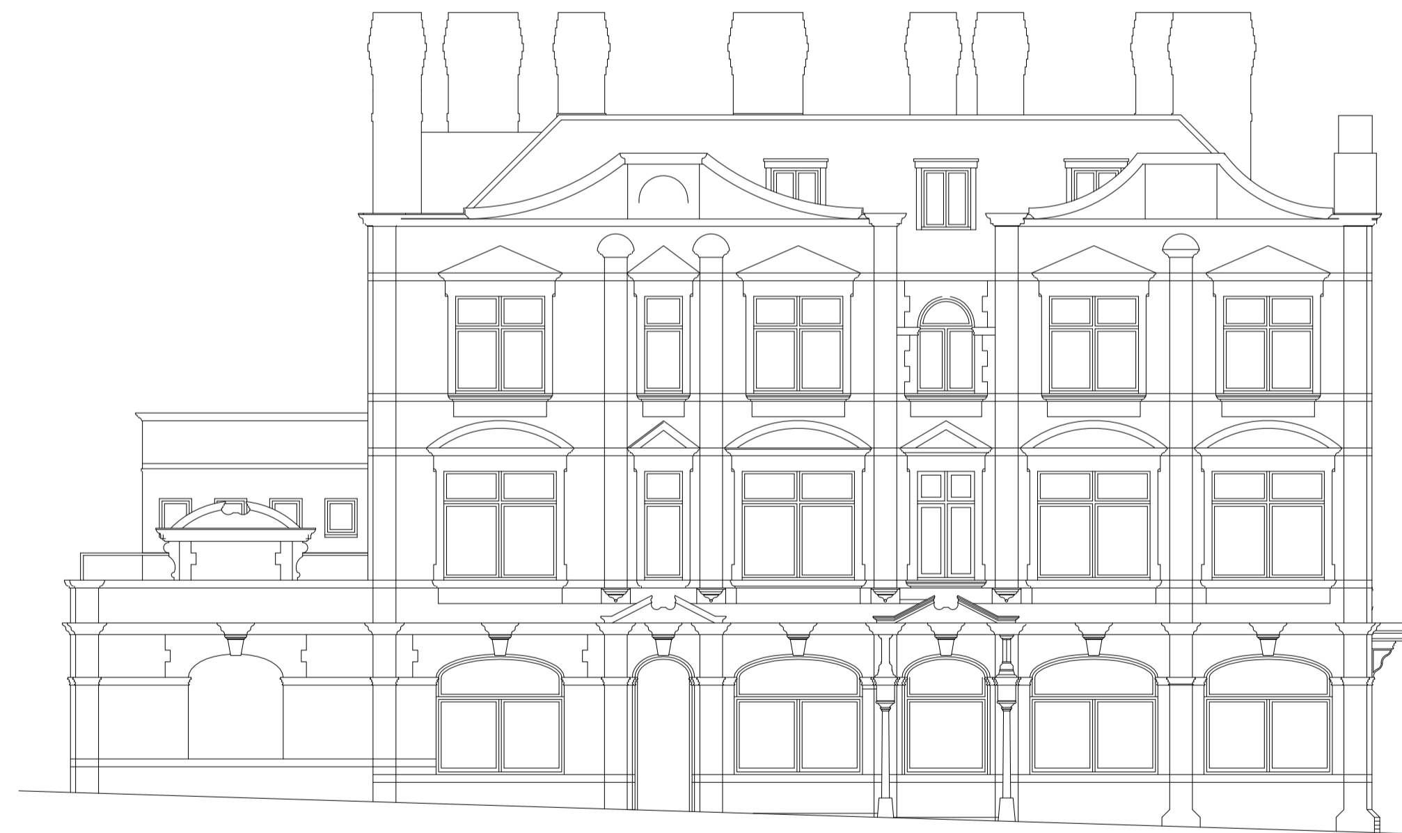
Side Elevation - Leighton Avenue