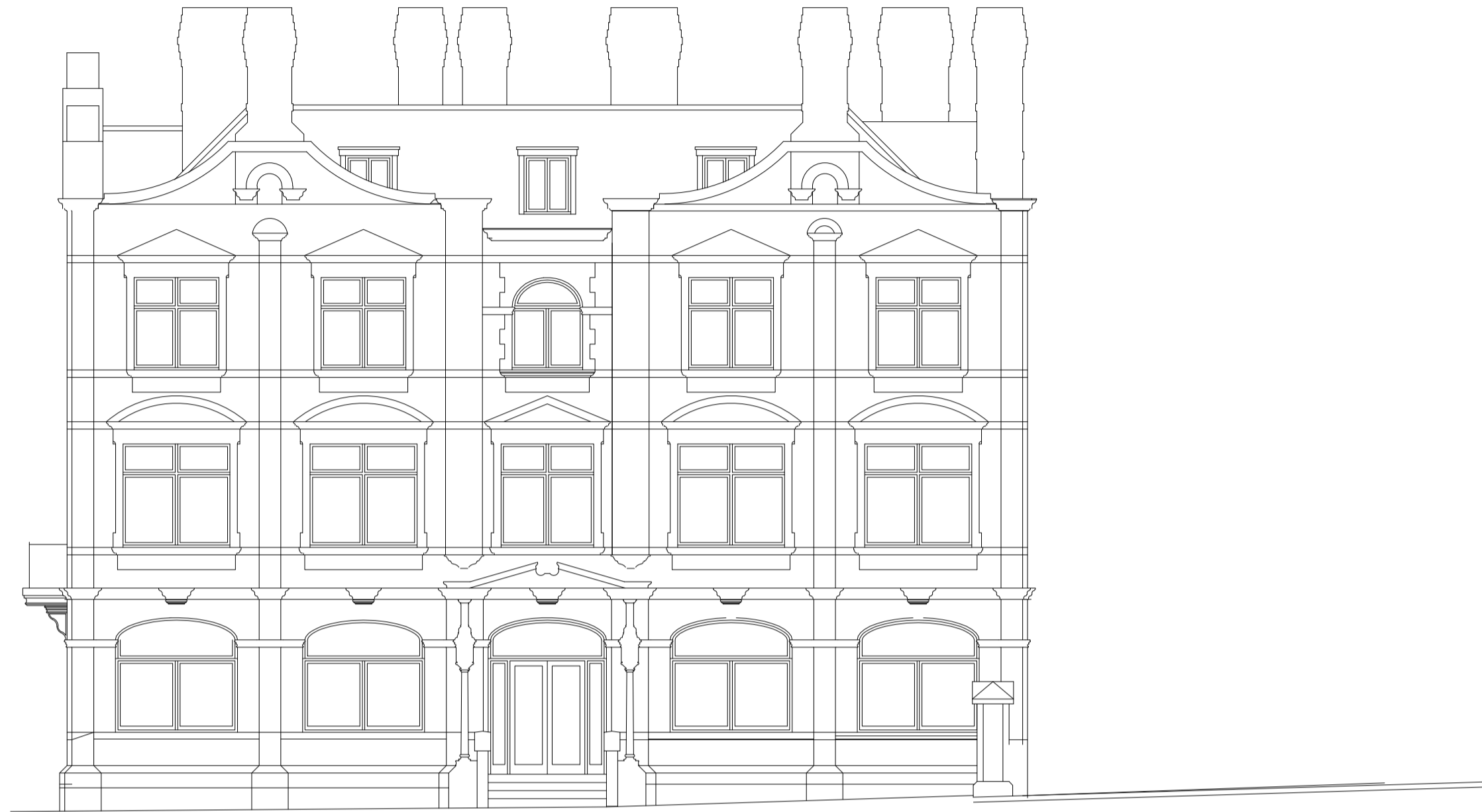
Side Elevation - Broadway